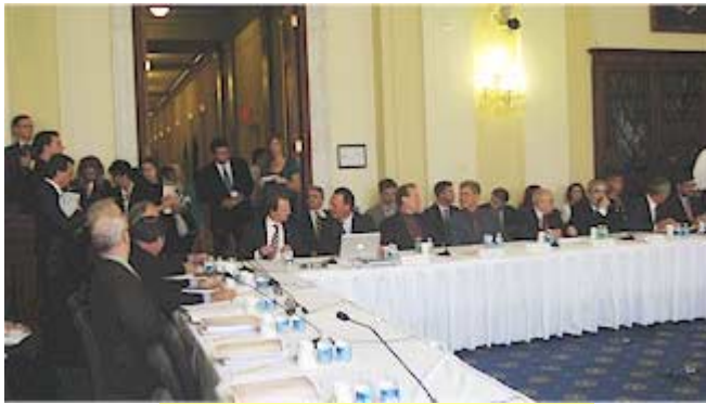
The Hearing about to begin