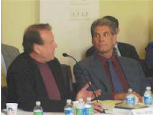
Dawson's Poignant Testimony