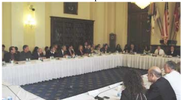
The Meeting Being Called to Order